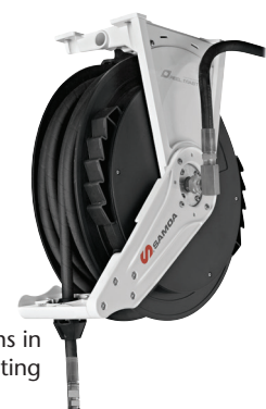
Reel with arms in ceiling mounting position.