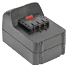
169 020 / 169 021